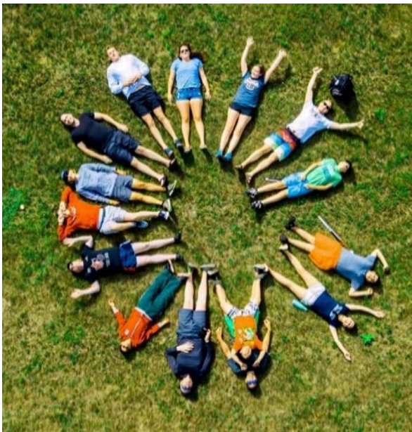
Camp Abilities staff and campers from the summer of 2018.

“CNIB Lake Joe has taught me that if you believe, you can achieve. Anything can be accomplished in life, no matter the limitations, and this camp has been no exception. As most camps were cancelled in the summer of 2020, CNIB Lake Joe persevered and launched virtual programs. Being involved with the virtual sports camp, I witnessed all the smiles on the screen and active participation. Volunteering at CNIB Lake Joe will change your life in such a positive way, leaving you with experiences that will be remembered for a lifetime.”