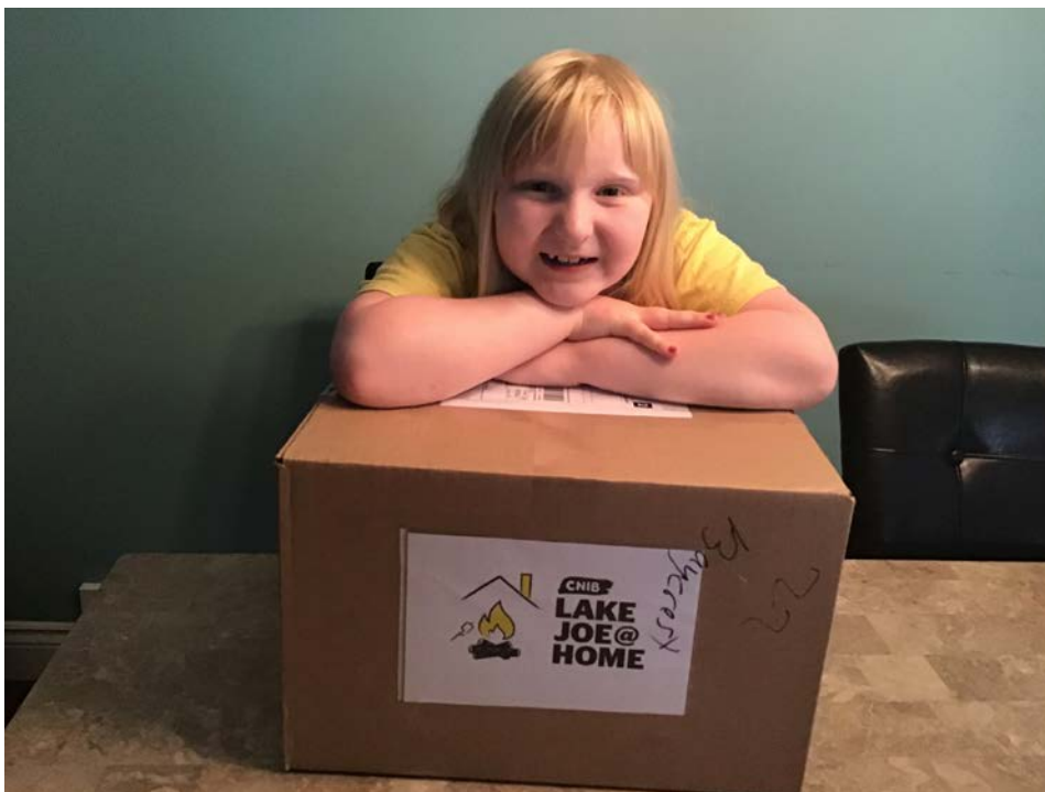
A young CNIB Lake Joe camper smiling, about to open her summer Camp-in-a-Box.