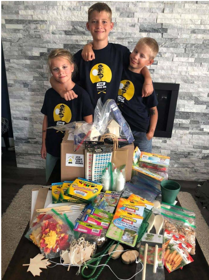
Young campers show off their Camp-in-a-Box contents.

With $10,000 in funding from the Military Police Fund for Blind Children, we created our first-ever CNIBLakeJoe@Home Camp-in-a-Box program . One hundred children (ages 6-18) from across Canada registered for four weeks of summer programming, all at no cost to families.