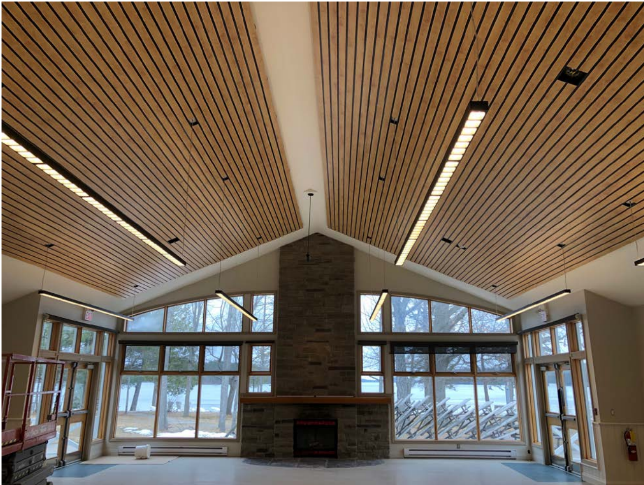
The Lounge featuring a beautiful new wood ceiling