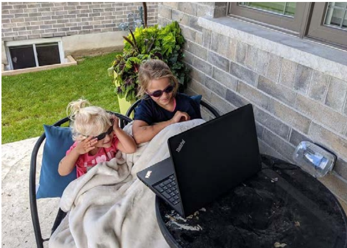
Two girls participating in CNIB Lake Joe Camp-in-a-Box Zoom sessions outside in the fresh air.

“The kids had such an amazing time over the last few weeks through the Camp-in-a-Box program. It was so nice to connect with past camp counsellors/friends and meet new ones. Thank you to everyone involved for such an amazing experience in uncertain times.”