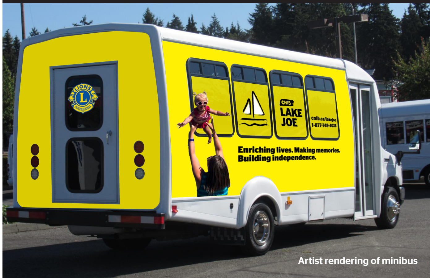
Artist rendering of minibus

Visit cnib.ca/LakeJoeMinibus for full details and to donate.